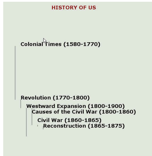
Fig. 3. This approach can be applied to major episodes of US history. The history browser home page is shown. At present only the “Causes of the Civil War” link is functional, as described above.